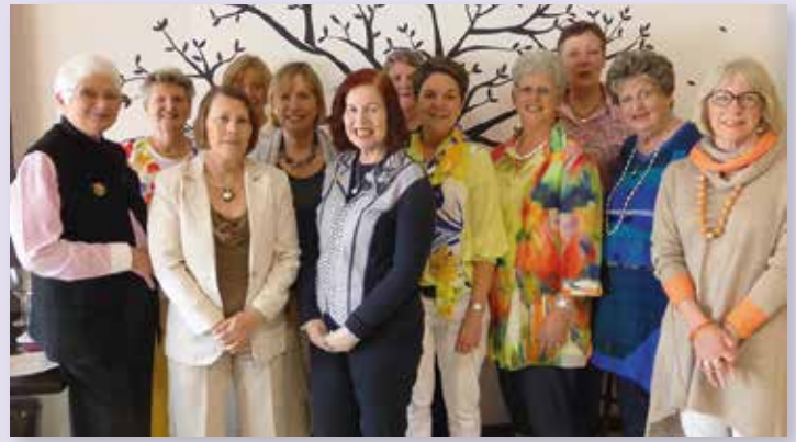
A happy group of Woodlands Old Scholars in Penola, about to leave for some wine tasting and shopping before heading home.