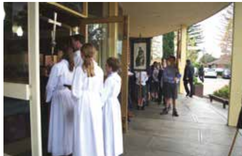
The Choir preparing to process into the Chapel at the start of the Service.