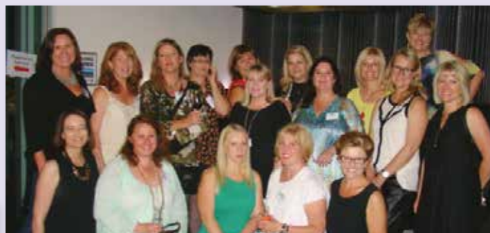
The 1984 group at the Holdfast Hotel.